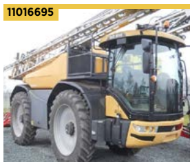
11016695 Challenger RG655, 11 Reg, 3291hrs, £115,000