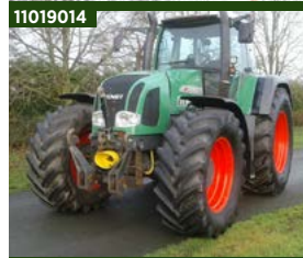
11019014 Fendt 926, X Reg, 8000hrs, £36,000