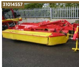
31014557 Used Pöttinger 305 HED mower conditioner £8,500