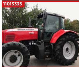
11013335 MF 7490, 05 Reg, 5767 hrs, £28,500