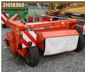
21018360 Used Kuhn FC302 £4,150