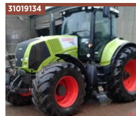
31019134 Claas Axion 850, 08 Reg, 6486hrs front links £28,500