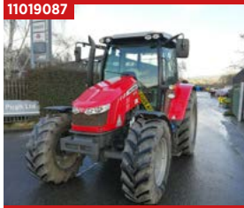
11019087 MF 5612, 15 Reg, 120hp, 1212hrs, £38,500