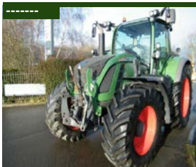
----- Fendt 720, 14 Reg, 3846hrs, EPOA