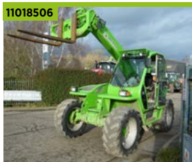
11018506 Merlo 34.7, 4192hrs, £25,000