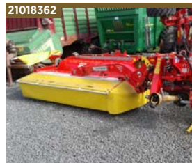
21018362 Used Pöttinger 302 disc mower £8,290