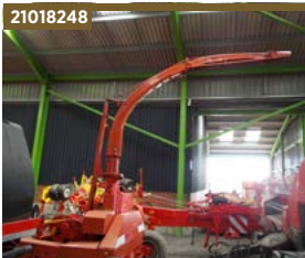
21018248 Used Pöttinger Mex 6 forage harvester £6,500