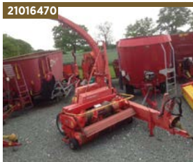
21016470 Used Pöttinger Mex 6 forage harvester £6,500