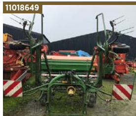
11018649 Used Krone 550 tedder £2,350