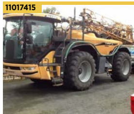
11017415 Challenger RG635, 12 Reg, 5196hrs, £92,000