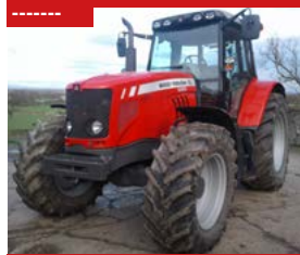
----- MF 6465, 11 Reg, 140hp, 1360hrs EPOA