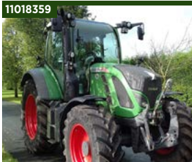
11018359 Fendt 514, 14 Reg, 5131hrs, £59,000