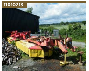
11010713 Used Pöttinger Novacat 265 HED £2,750