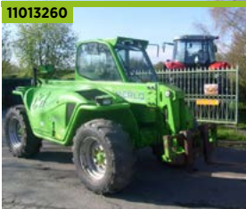
11013260 Merlo 40.7, 08 Reg, 4369hrs, PUH £27,000