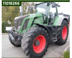
11018266 Fendt 828, 11 Reg, 280hp, 8053hrs, £71,000