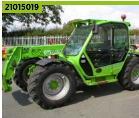
21015019 Merlo 32.6, 61 Reg, 3819hrs, £32,000