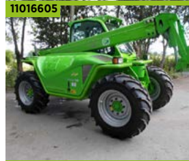
11016605 Merlo 40.7, 12 Reg, 5211hrs, boom susp'n £33,000