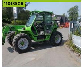
11018506 Merlo 41.7, 12 Reg, 5583hrs, £30,000