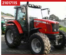
21017115 MF 5460, 10 Reg, 125hp, 5700hrs £28,500