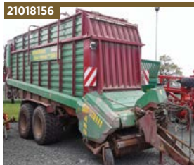
21018156 Used Strautman forage wagon 3501 £24,500