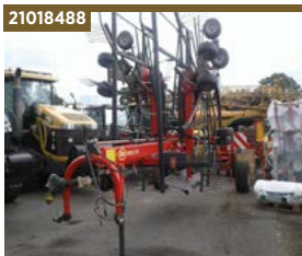
21018488 Used Vicon Analex 1104, twin rake £15,000