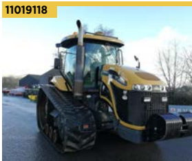
11019118 Challenger 765C, 12 Reg, 2757hrs, Topcon receiver/screen £102,000