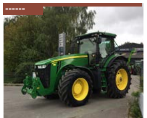
----- John Deere 8345R, 1526hrs EPOA