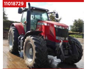
11018729 MF7626, 14 Reg, 260hp, 2611hrs front links £65,000