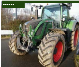
----- Fendt 720, 15 Reg, 2765hrs, EPOA